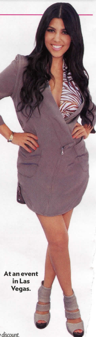
At an event in Las Vegas.