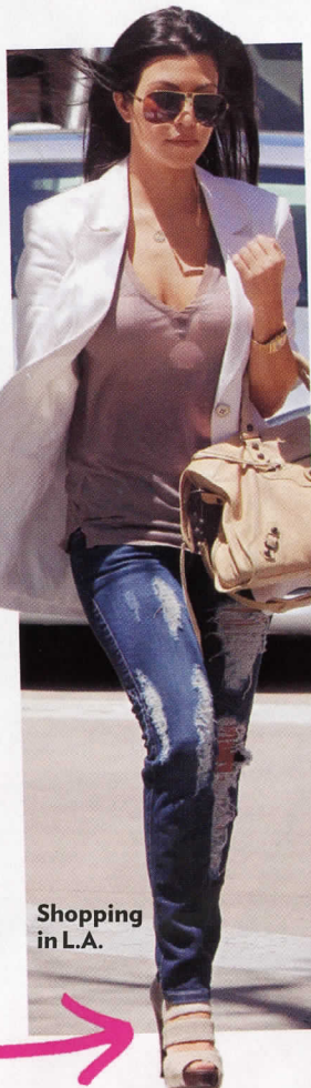
Shopping in L.A.