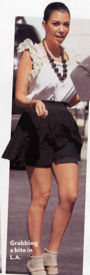
Grabbing a bite in L.A.